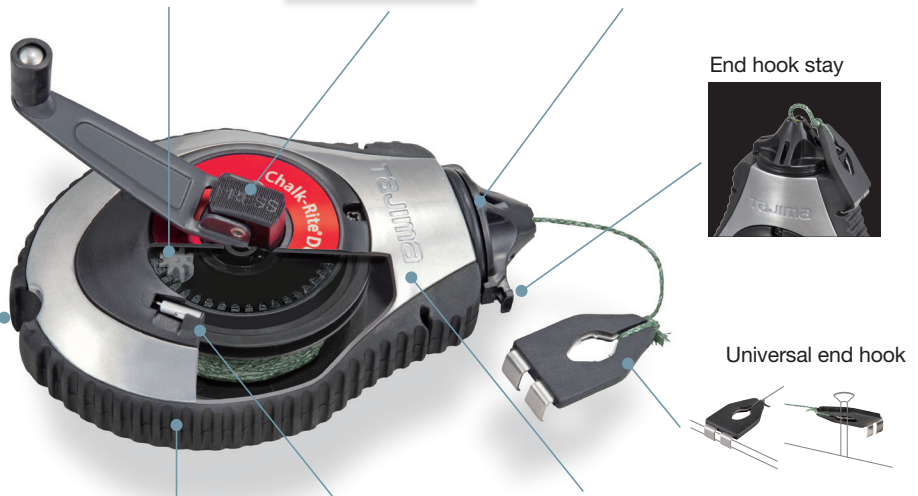
Universal end hook